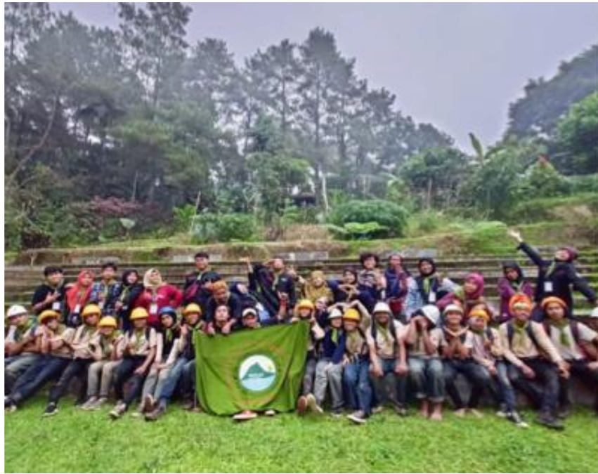
Figure 4. Induction Ceremony of Sapala Members at Kiskendo Cave