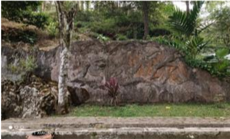
Figure 1. Relief Depicting Subali's Victory Over Mahesosuro and Lembusuro to Become King of Kiskendo

Kiskendo Cave is a natural tourist attraction located in Jatimulyo Village, Girimulyo District, Kulon Progo Regency, bordering Purworejo Regency, Central Java. Situated within the Menoreh Mountains, the cave extends approximately 1.5 km with two major branching passages. The cool and pristine environment surrounding the cave makes it an appealing destination for tourists seeking an ecology- and culture-based travel experience (Wardana, 2023 ). One of Kiskendo Cave's most distinctive features is its stalactite and stalagmite formations, along with intricate relief carvings adorning its cave walls. These carvings depict figures from Javanese wayang mythology, including Sugriwa, Subali, Mahesosuro, and Lembusuro, further enhancing the cave's aesthetic and historical value (Interview with Suisno, June 9, 2024).