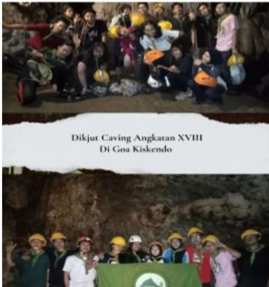
Figure 3. Caving Activities by MAPALA SAPALA at Kiskendo Cave

Between 1974 and 1978, the Provincial Government of Yogyakarta Special Region initiated a land acquisition process covering approximately 5 hectares around Kiskendo Cave to support tourism development. The government also began constructing essential facilities, which eventually led to the official inauguration of Kiskendo Cave as a public tourism site on July 26, 1987, by the Regional Government of Yogyakarta Special Region.