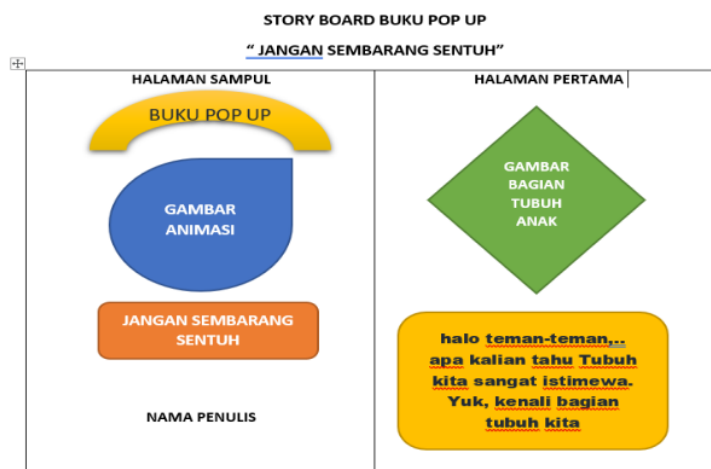
Figure 1. Storyboard Buku Pop Up LindungiAku

The third stage is the media development stage according to the storyboard that has been made. The first step is to analyze the storyboard that has been made to develop and improve the initial storyline. The second step is making sketches of images manually and selecting material based on the theme of the educational book LindungiAku pop up book. The design style used in the ProtectMe pop up book is a cartoon style. The choice of cartoon style was taken because cartoon has shapes that are in accordance with the character of elementary school children. Display in a pop-up book not all pages use the 180o pop-up type, that is when the paper is opened as a whole, you can see the three-dimensional side of the book. Sketches of images and materials can be seen in Figure 2 .